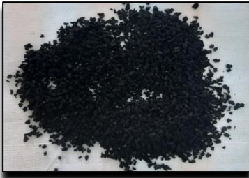
Fig. 3. Rubber grains.

Fig. 3. Three different concrete mixes in proportion of rubber content of 0%, 5% and 15% to study the effect of rubberized concrete on ductility and ultimate bearing capacity of columns were investigated. Compressive strength of the different concrete mixes was obtained by testing standard concrete cubes as shown in Fig.4. FRP sheets were used to strengthen the deficient specimens to compensate the lost strength and eliminate the premature failure. Strengthening techniques included FRP type; Carbon Fibre Reinforced Polymers (CFRP) or Glass Fibre Reinforced Polymers (GFRP), number of FRP layers and orientation of fibres. Twenty-three specimens were studied including three concrete filled steel tubular columns with concrete mix of 0%,5% and 15% rubber content as control specimens. Twenty other specimens with transversal or longitudinal deficiency including 10 specimens with 5% rubber content in the concrete mix and 10 specimens with 15% rubber content in the concrete mix as shown in Fig.5.