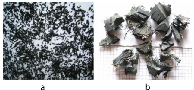
Fig. 1. Types of crumb rubber. (a) Manufactured (ground) rubber and (b) Waste tire chips [16].