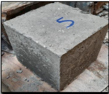
Fig. 4. Standard cubes after 28 days of curing.